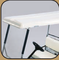
Canopy Top White and Beige