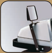
West Coast Mirror/Heavy-Duty Bumper