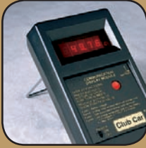
Communication Display Module