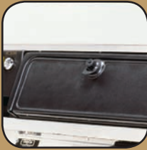
Glove Box With Lock